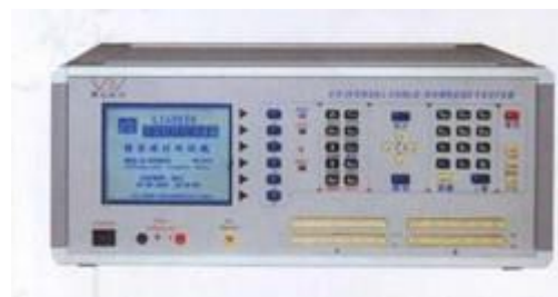
LCD for industrial control